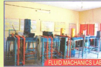
FLUID MACHINICS LAB

Hostel facility is available for the boys in a 120 capacity hostel. The hostel facility is also available for the girl students, sharing hostel facility with the RJIT Engineering (Degree) College girl's hostel, which is situated at RJIT, Tekanpur campus.